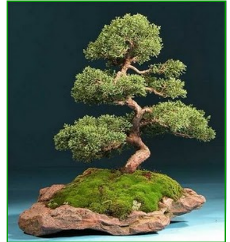
Shimpaku Juniper on rock Bonsai

recommends to try to cover the entire surface of the soil with moss if you have it. Also put the moss right up to the edge of the pot, but make sure it is lower than the lip of the pot so water can catch and drain down into the soil. Having the moss look as natural as you can make it will greatly enhance the appearance of your trees. Most dry soil loving trees such as pines and most conifers should have less moss. If your moss on these is green and healthy, chances are that you may be watering too much. For most trees, water as normal but also lightly mist the moss on a daily basis.