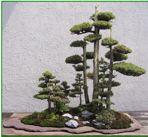
Foemina Juniper Bonsai Forest at the National Bonsai and Penjing Museum

M oss is used by bonsai enthusiasts to add an element to our bonsai that helps with the overall look of the tree. It is put onto the soil surface to give the impression of grass, plants, and the like, growing under the tree. This help however is often canceled out by the fact that moss, if allowed, will keep water from penetrating to the soil below. It can also trap in moisture and not allowing the soil to dry out. This is the reason why it is recommend that moss be applied only to the surface of the soil a short time before showing the bonsai and removed soon after.