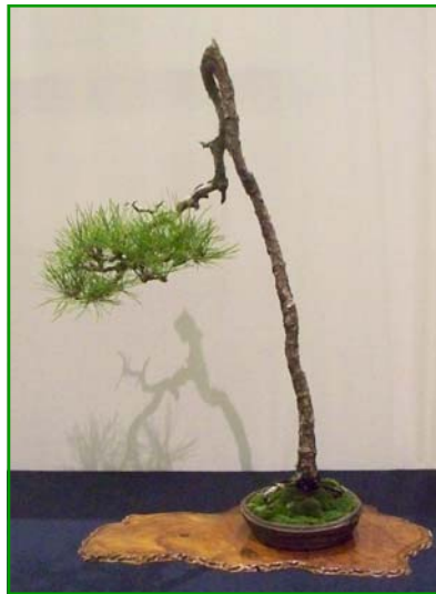
Award winning Japanese Red Pine by Will Hebert

The Literati style has its emphasis on trunk line and movement. It is characterized with a few branches at the top of a long, visually pleasing, twisted trunk. The unglazed pots used for this style are usually small, round and shallow to balance the meager foliage. This style is inspired by the paintings of pine trees that grew in harsh climates, struggling to reach the light of the sun in their rocky surroundings. The idea is to demonstrate that the tree really has to make a great effort to survive.