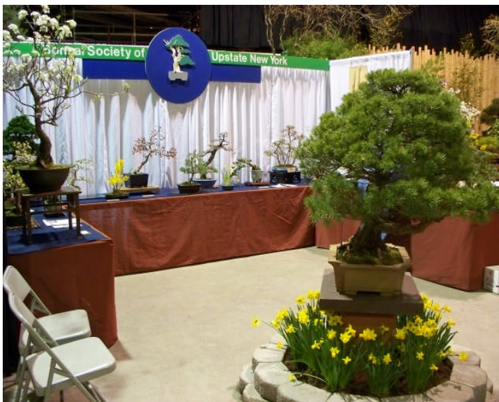
BSUNY GardenScape Display 2009

Hope to see you there. Please tell your friends. It should be a great show.