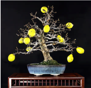
Bill Valavanis tree