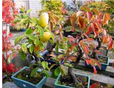
Quince in Fall colors